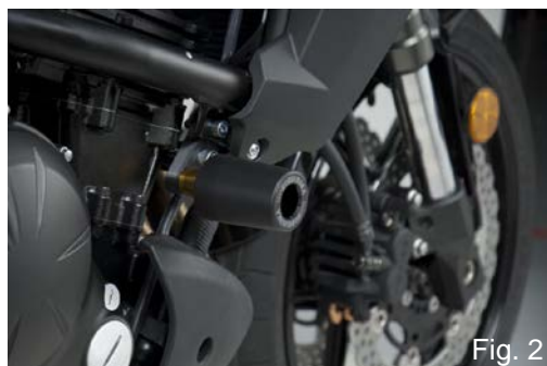
Fig. 2 Right Side