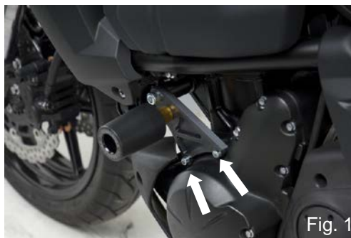
Fig. 1 Left Side